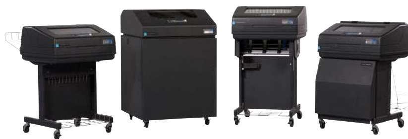
6600 Open Pedestal