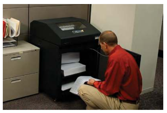
FRONT PAPER ACCESS = Load forms and retrieve printed output from the front of the P7000 Cartridge Cabinet. This option allows you to better utilize office space by placing the printer against a wall.